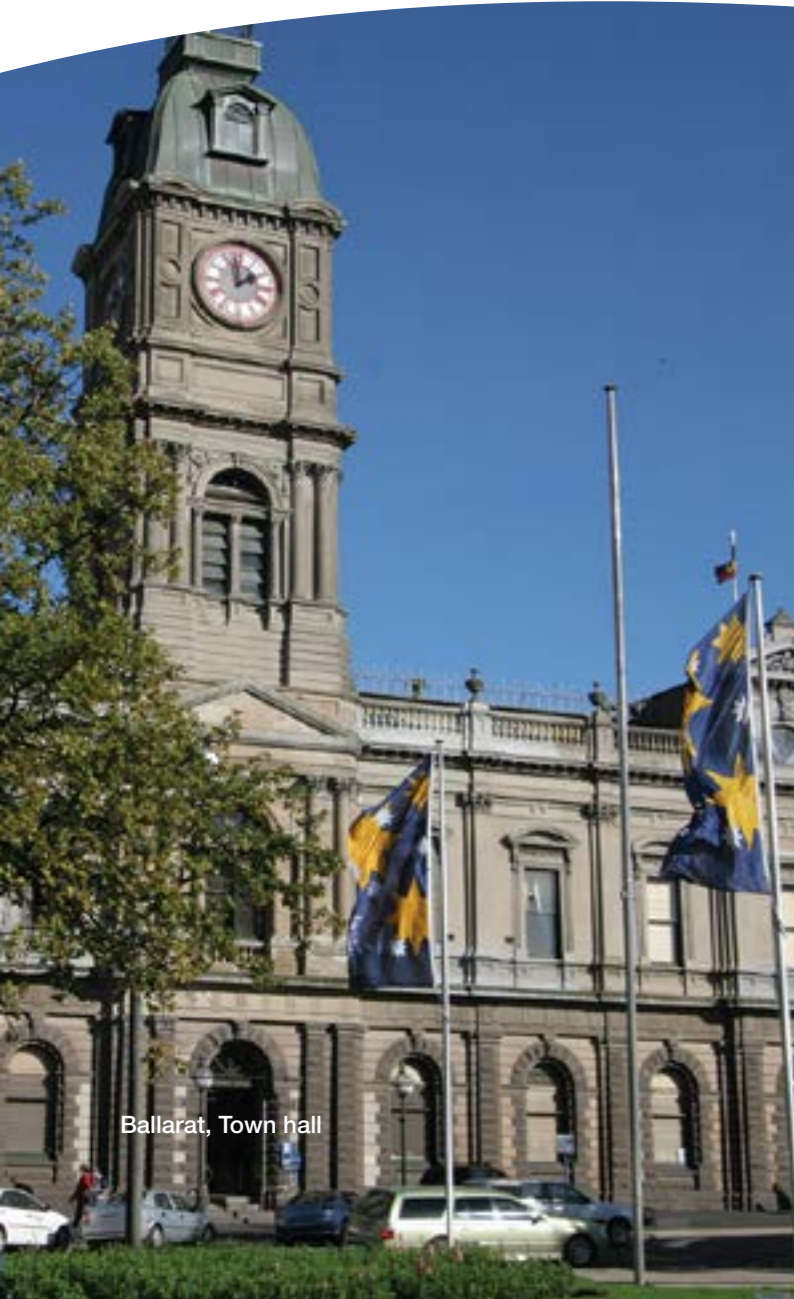
Ballarat, Town hall