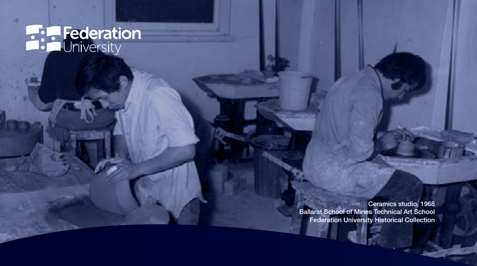
Ceramics studio, 1968 Ballarat School of Mines Technical Art School