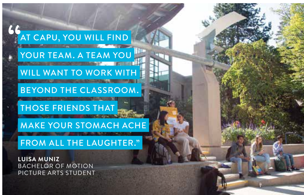
CapU Main Campus, North Vancouver, B.C.

If English is not your primary language, you must submit proof that you meet CapU's English Language Requirement. This is a requirement for all programs except if you start your studies at CapU with the English for Academic Purposes (EAP) program.