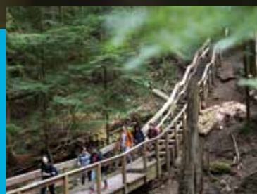
Baden Powell Trail, North Vancouver, B.C.