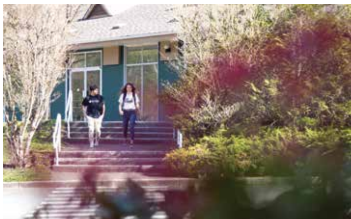
CapU Residence, North Vancouver, B.C.