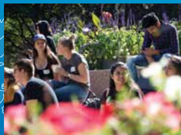
Main Campus, North Vancouver, B.C.

Source: Meteorological Service of Canada