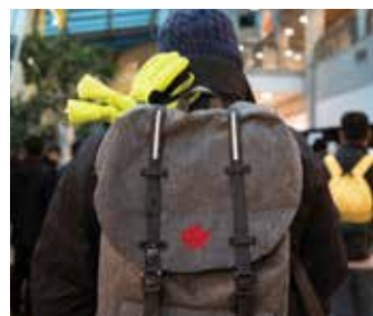
CapU Main Campus, North Vancouver, B.C.