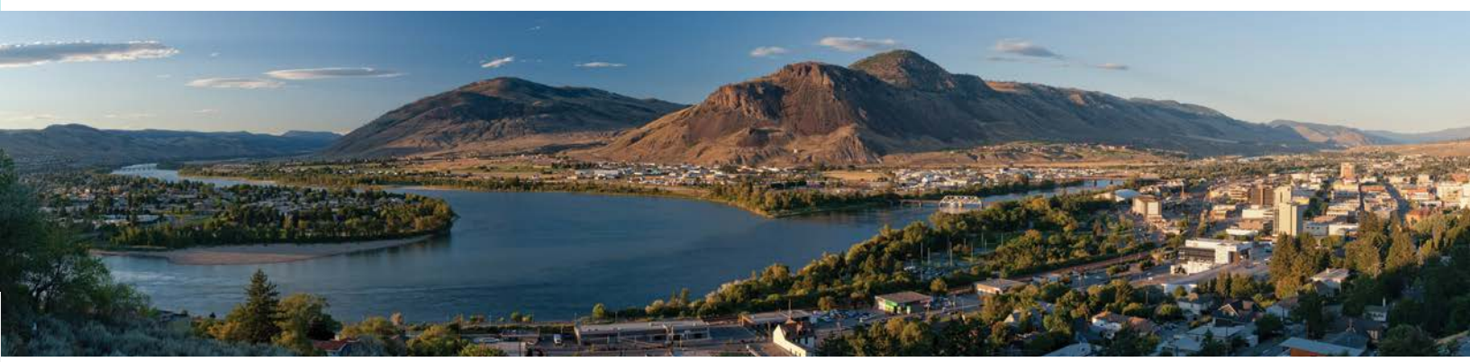
Sun Peaks Resort named #2 in best Canadian ski destinations by Canadian Living Magazine