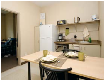
TRU Residence Floor Plans